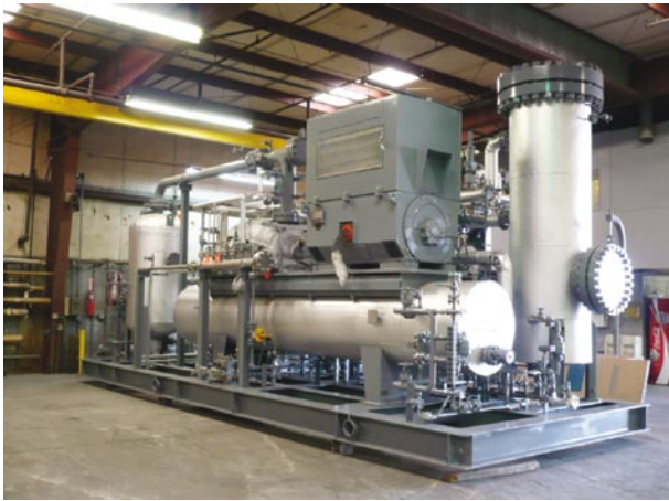
Figure 5. Higher pressure (70 bar = 1000 psiG) screw gas compressor package.

Due to the tremendous advantages offered by the high pressure screw gas compressor, its use and list of successful applications are growing. High pressure screw gas compressors continue to be utilised for many new applications requiring high pressure gas compression within various industries.