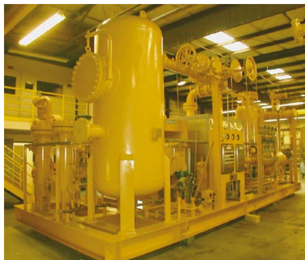
Figure 4a. Fuel gas booster for aeroderivative gas turbine (GE LM6000).

compressors (API-617). For example, high pressure screw gas compressors are used for fuel gas boosting services for highly efficient aeroderivative gas turbines (Figure 4a); hydrogen services for gasoline desulfurisation unit (GDU) processes; steam methane reformer (SMR) processes; platformer, continuous catalytic reformer (CCR) processes and so on (Figure 4b). The specific benefits provided by screw gas compressors include: more reliable, longer maintenance free intervals of operation; lower noise and lower emissions mean they are more environmentally friendly; screw compressors allow for a smaller installation area and a less complex foundation is required. Screw compressors are more flexible in handling variable and changing operating conditions (turndown, gas pressure changes, gas composition changes, etc.) In addition, the screw gas compressor provides tremendous power savings via the built-in slide valve mechanism, and can also manage to achieve tight limits on the oil content in the discharge gas, typically in the range of 0.1 ppm by weight. Tighter requirements in the ppb level can also be supplied utilising KOBELCO's sophisticated oil separation systems with many successful experiences, especially for catalytic processes.