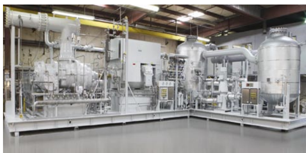
Figure 2. Hydrogen tail gas for pressure swing adsorption (PSA) process.

end of the rotor lobes. Thrust bearings are typically tilting pad type and are located on the outer side of the journal bearings. The oil and gas mixture is discharged through the compressor discharge nozzle into an oil separation system located downstream of the compressor. Oil separated in the oil separation system is circulated in the compressor lube system.