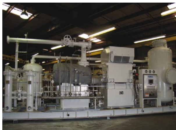
Figure 4b. Hydrogen booster for refinery continuous catalytic reformer (CCR) process.