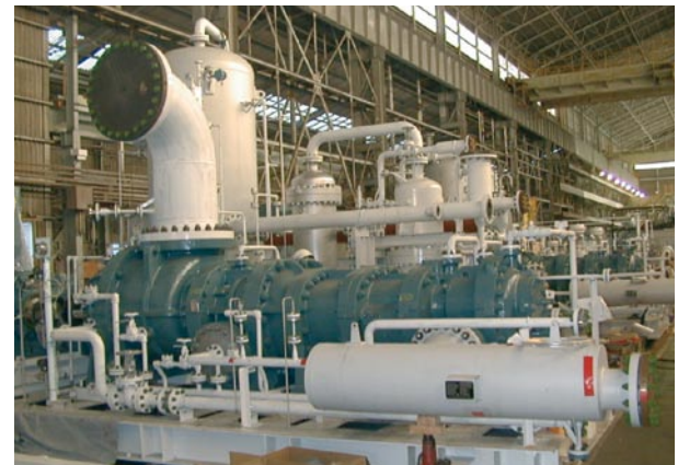
Figure 6. Hydrogen (99.5%) booster for dissociation process.

positive displacement compressor, the oil injected screw compressor.