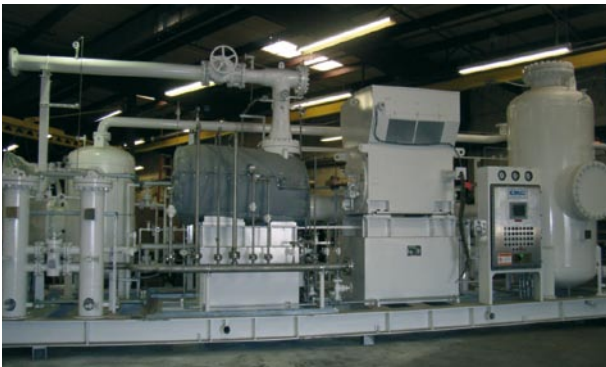
Figure 3. Hydrogen (94%) booster for continuous catalytic reformer (CCR) process.