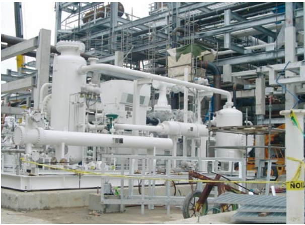
Figure 2. Hydrogen (94%) recycles gas for gasoline desulfurisation unit (GDU) process.