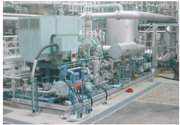
Figure 4. Hydrogen (90%) recycle gas for heavy catalytic cracked gasoline (HCCG) process.

On the other hand, in the last 10 - 20 years a third option has been gradually appearing in the market. It is another