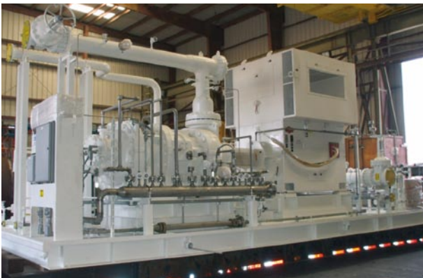
Figure 5. Hydrogen (99.9%) booster for steam methane reformer (SMR) process.

typically positive displacement type it is not affected by gas composition and has the simplest compression mechanism. It can also achieve the high pressure levels (200 barg or 3000 psig) required by some oil refinery processes. However, the main problem with reciprocating compressors is the frequent maintenance that is required during operating periods that can increase the running costs (including man power and replacement parts) and limit capacity handling volumes. Therefore, given the case that large volumes of hydrogen are required due to the current trend for larger capacity industrial plants, centrifugal compressors are sometimes used when the compression ratio is low.